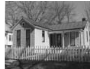
412 Church Street, rehabilitated