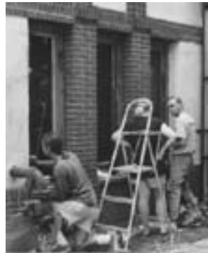
Window rehab workshop