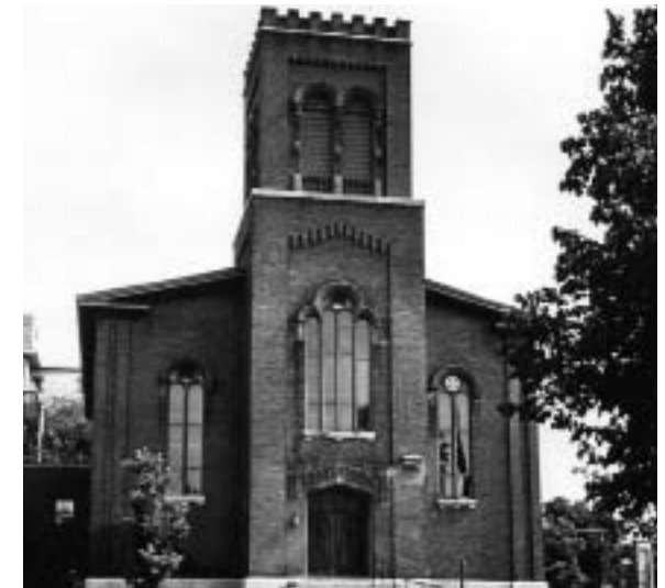
Old Brick, saved

In 2007, Friends was recognized by the national Trust for Historic Preservation with a national Preservation Honor Award for the massive recovery effort made to protect the historic fabric of the community after the April 13, 2006 Tornado. In years prior, Friends invested in the community with both volunteer labor and funds to restore Iowa City's Englert Theatre, purchased endangered homes in historic neighborhoods to restore and return to the community as single family residences, and many times stood with other citizens and groups to save endangered structures like the Carnegie Library.