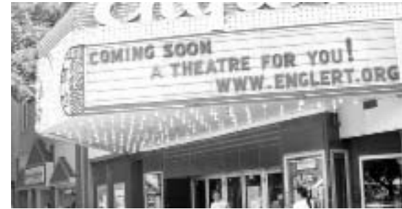
Englert Theatre, rehabilitated

Friends has supported the move and restoration of the Wetherby Cottage as well as the rehabilitation of a number of historic structures in Iowa City. Year round, Friends operates the Salvage Barn of architectural and historic building parts. The Barn provides a cost effective way for owners of older buildings to repair and restore structures in accordance with the Secretary of the Interior's Standards.