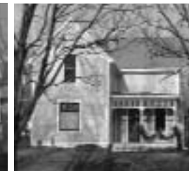
511 Church Street, rehabilitated