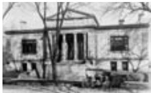
Carnegie Library, saved