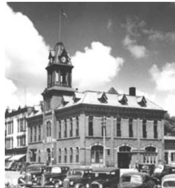
Old City Hall, Iowa City, razed 1961

Many of our architectural treasures, such as Old City Hall, have been lost in the name of progress and development. You can make a difference. By joining Friends and supporting the establishment of historic and cultural districts in Iowa City and Johnson County, you can give our architectural history and older neighborhoods a chance to survive.