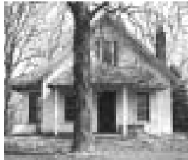
Bluffwood Cottage, lost