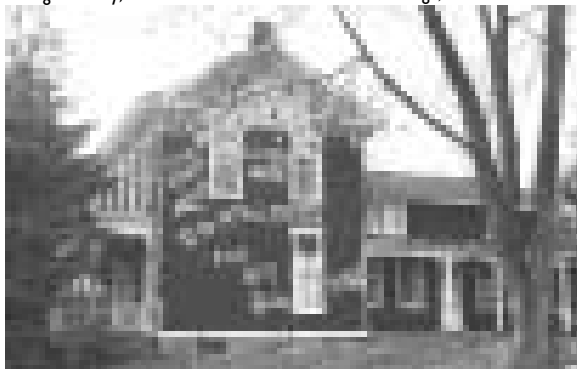
527 Dubuque Street, lost