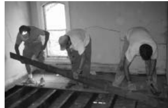
FHP volunteers saving flooring to be recycled at the Salvage Barn